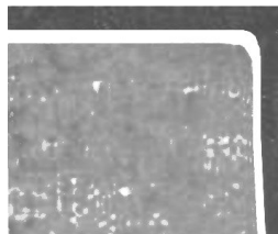
Precision Apticote Hard Chrome Plate showing no edge build-up.