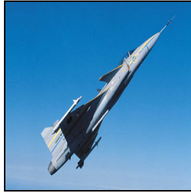
Apticote 100 controlled deposition on JAS 39 flight actuators